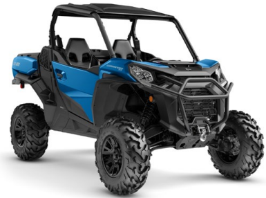
XT | 1000R