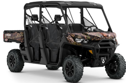
XT | HD10 HD10