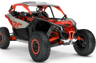
X rc | Turbo RR