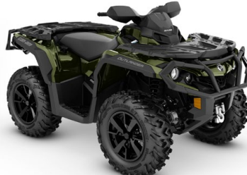
XT | 650, 1000R