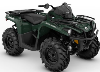
XU | 450, 570