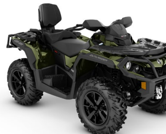
XT | 650 650