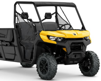
DPS | HD10