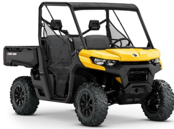
DPS | HD8 HD8