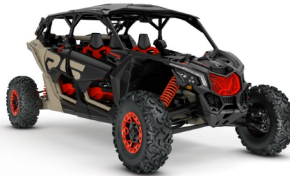
X rs SAS | Turbo RR