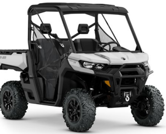
XT | HD10