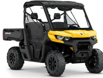
XU | HD8