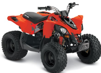
DS | 90