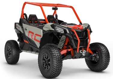
X rc | Turbo RR