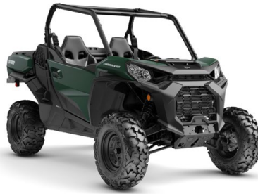
DPS | 1000R