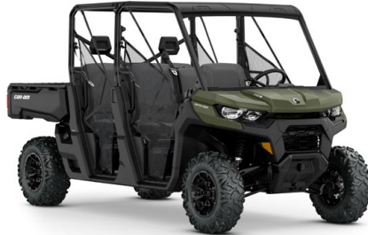
DPS | HD8