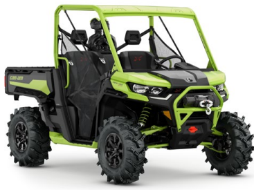
X mr | HD10