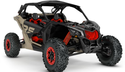
X rs SAS | Turbo RR