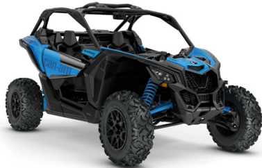
DS | Turbo