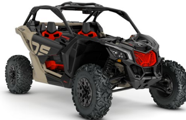
X ds | Turbo RR