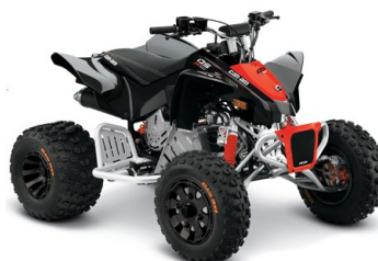
DS | 90X